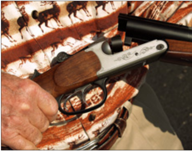
Blaser Model S2 showing double triggers, wood and metal work.