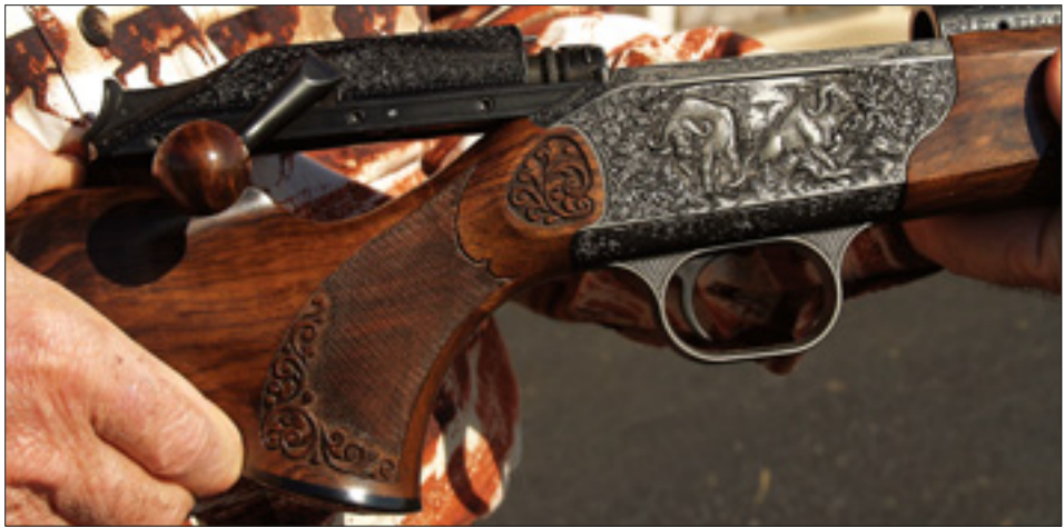
Blaser Model R93, showing engraving on right side of action and matching stock with wooden bolt knob.

The distinct bolt-to-barrel relationship provides a solid, one-piece interlocking system that defies compromise. The bolt and barrel become a single unit when locked together, eliminating the need for the complete action to