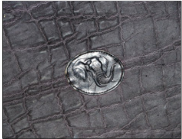
Elephant emblem on outside of gun case.